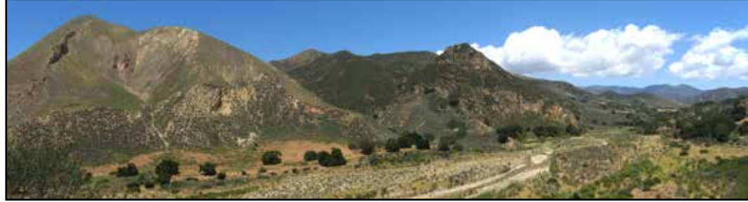
The Sisquoc River flowing through the San Rafael Wilderness in the backcountry of the Los Padres National Forest (Photo courtesy of Chris M Morris).

In the wake of the Zaca fire, invasive plants have established a foothold in this remote area of wilderness – most concerning among them tamarisk (also known as salt cedar). Tamarisk, a deciduous shrub or small tree native to Eurasia, thrives in streambeds with often little to no water by use of its deep and extensive root system that it uses to draw up groundwater. Not only does their thick root system crowd out the roots of other native plants, but it consumes huge amounts of water turning streams to bone dry washes. Tamarisk readily regenerates from remnant roots after the rest of the tree is scoured away from a flash flood. A single tree can produce as many as 500,000 seeds in a single growing season. Suffice to say, tamarisk poses a very serious threat to any ecosystems it invades. ...continued on page 3