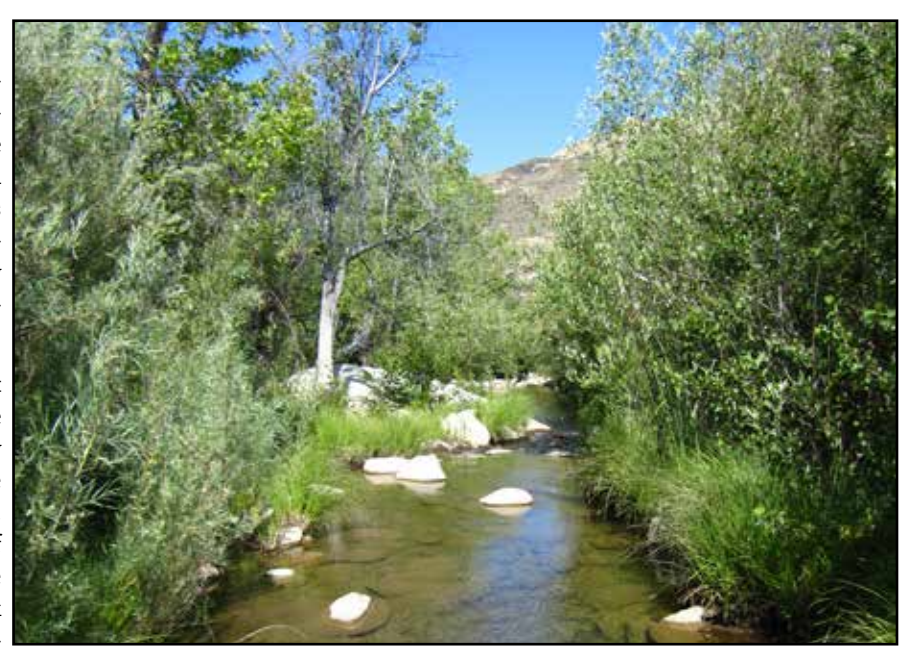
The Manzana Creek in the San Rafael Wilderness provides critical habitat to steelhead trout, arroyo toads, and California red-legged frogs (photo courtesy of Chris M Morris).

We are honored to be awarded this grant that allows us to undertake this project and we are humbled at the scope of what will be necessary to complete this project. In total, we will remove tamarisk within 61 miles of backcountry streams. Because there is no motorized access to most of the project area, all personnel and supplies will be packed in on foot and a mule pack train. Tamarisk trees will be removed in a way that does not impact the sensitive riparian habitat that they have invaded.